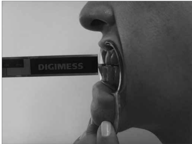
Figure 6. Mandibular protrusion.

For the statistical analysis of the data we used the ANOVA, confidence interval for the mean and p -value tests, with 0.05 significance level (5%).