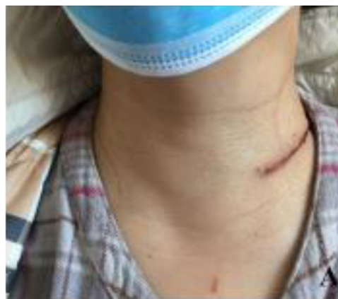
Figure 2 The appearance of the incision 3-days after the operation is demonstrated.

All the intraoperative variables are shown in Table 1 . There were no statistically significant differences in intraoperative blood loss, operative time, total drainage volume and hospitalization expense between the two groups ( p > 0.05 ). The incision length was significantly different between the two groups: it was 5.2 \pm 1.04 cm versus cm in the LS group and 6.9 \pm 1.14 cm in the CT group ( p < 0.05 ). The number of lymph nodes and lymph node metastasis rates in the LS group were higher than that in the CT group