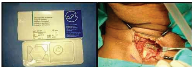
Figure 2 A, Titanium vocal fold medializing implant (TVFMI®). B, TVFMI® placed in the cartilage window.

post-operative values of GRBAS were compared separately using paired Student's t-test. Individual parameters of acoustic analysis and EGG were also compared pre- and post-operatively, and the p-values were calculated. Student's t-test for independent variables was used to compare the improvement in parameters (VHI, GRBAS, acoustic analysis, EGG) following the type I thyroplasty with silastic implant or TVFMI®. p-values less than 0.05 were considered to be significant (95% confidence interval).