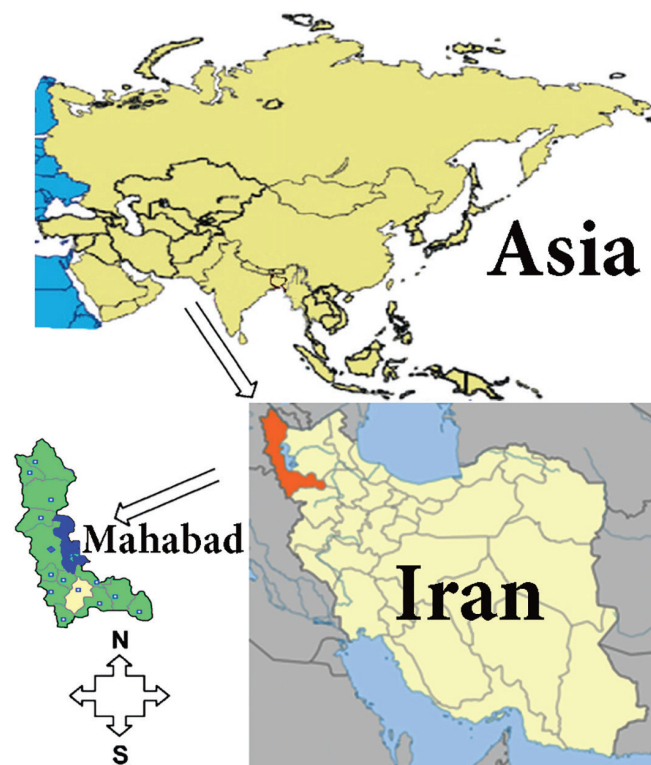
FIGURE 1 - Location of study area, Mahabad, in Iran Map

Interviewees were local traditional health practitioners (THPs) in addition to native people with practical or experiential information on medicinal plants. A total of 35 people were interviewed for this study. The