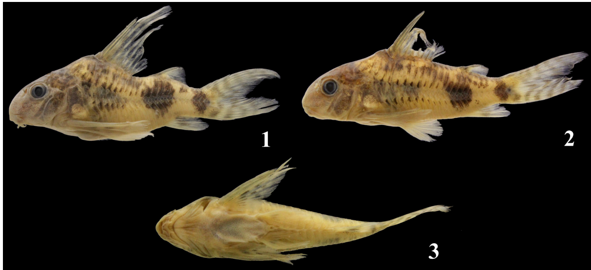
Figure 2. Bones dysplasia in Corydoras aff. longipinnis : (1) vertebral column; (2) head with hollow; (3) branchiostegal bones.