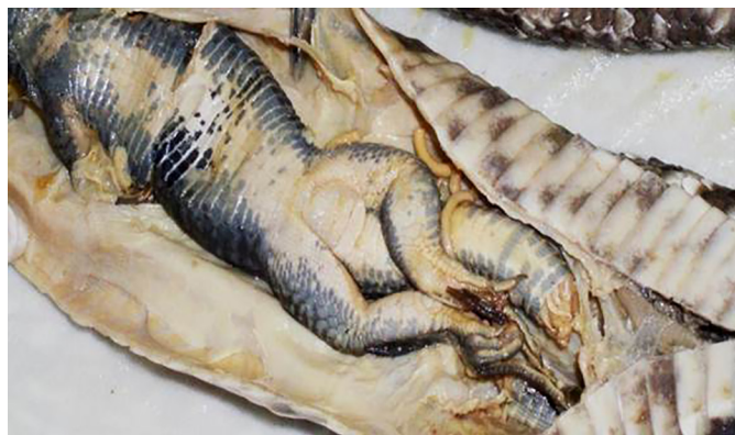
Figure 3. Food item, Ameiva ameiva , recorded in the stomach of a female Crotalus durissus . Specimen deposited in the Coleção Herpetológica da Universidade de Brasília (CHUNB 49673).