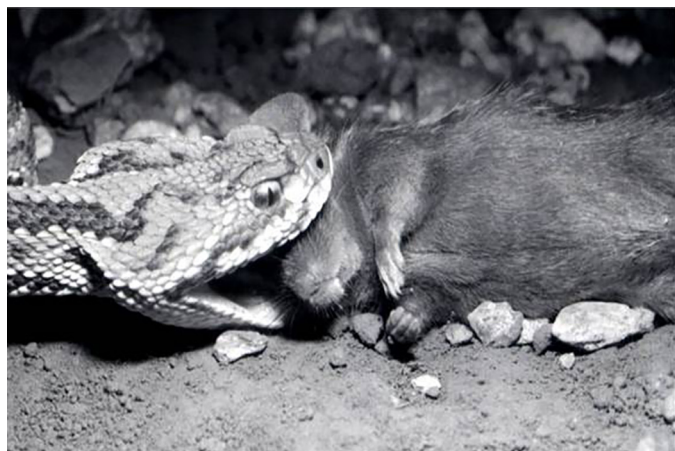
Figure 2. Food category (rodent) of Crotalus durissus from Distrito Federal.