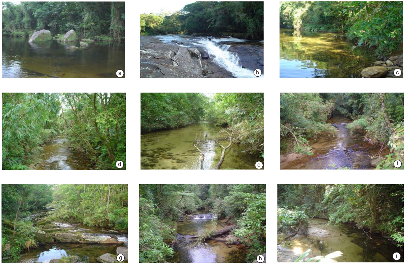
Figure 2. Sampled sites in the Rio Itatinga watershed, Parque das Neblinas. a) rio Itatinga (23° 44' S and 46° 09' W); b) rio Itatinga (23° 44' S and 46° 09' W); c) rio Itatinga (23° 44' S and 46° 09' W); d) stream mouth in the right bank of rio Itatinga (23° 47' S and 46° 12' W); e) rio Itatinga (23° 47' S and 46° 12' W); f) stream mouth in the right bank of rio Itatinga (23° 47' S and 46° 11' W); g) stream mouth in the right bank of rio Itatinga (23° 46' S and 46° 10' W); h) stream mouth in the right bank of rio Itatinga (23° 46' S and 46° 10' W); and i) stream mouth in the right bank of rio Itatinga (23° 45' S and 46° 09' W).

Figura 2. Pontos amostrados no rio Itatinga, Parque das Neblinas. a) rio Itatinga (23° 44' S e 46° 09' W); b) rio Itatinga (23° 44' S e 46° 09' W); c) rio Itatinga (23° 44' S e 46° 09' W); d) desembocadura de riacho afluente da margem direita do rio Itatinga (23° 47' S e 46° 12' W); e) rio Itatinga (23° 47' S e 46° 12' W); f) desembocadura de riacho afluente da margem direita do rio Itatinga (23° 47' S e 46° 11' W); g) desembocadura de riacho afluente da margem direita do rio Itatinga (23° 46' S e 46° 10' W); h) desembocadura de riacho afluente da margem direita do rio Itatinga (23° 46' S e 46° 10' W); i) desembocadura de riacho afluente da margem direita do rio Itatinga (23° 45' S e 46° 09' W).