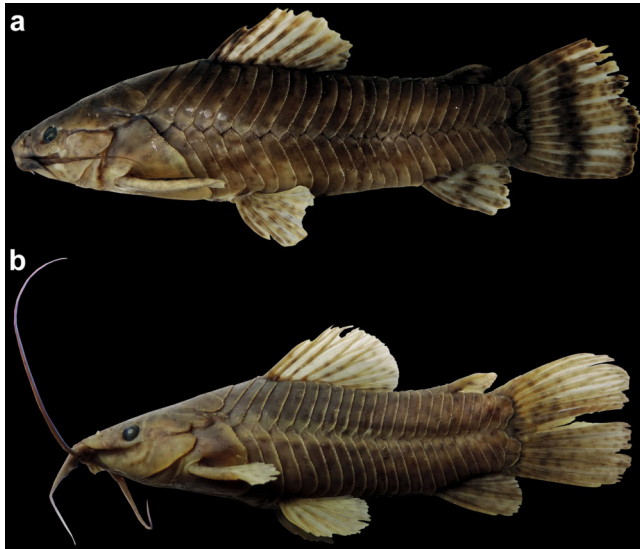
Figure 1. Lateral view of the (a) Megalechis picta specimen, ZUFMS-PIS 30, 100.0 mm SL, collected in the Baía do Quadrado, and (b) Megalechis thoracata , ZUFMS-PIS 54, 66.8 mm SL, from a lagoon tributary to the rio Miranda.