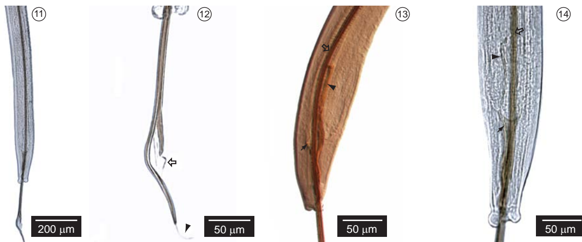
Figures 11-14. Philometra katsuwoni male. 11) Phase contrast of male posterior region. 12) Detail of right spicule indicating membranous enlargement at posterior region (large arrow) and pointed membranous distal tip (arrowhead). 13) Differential interference contrast (DIC) of posterior region of male showing right spicule (large arrow), left spicule (arrowhead) and gubernaculum (thin arrow). 14) Phase contrast of posterior region of male showing right spicule (large arrow), left spicule (arrowhead) and gubernaculum (thin arrow).

The morphology of specimens of the present material is, more or less, in agreement with the original description of Philometra katsuwoni provided by Petter & Baudin-Laurencin (1986). However, the males (except for one) of the Brazilian material were generally distinctly larger (14-17 vs. 9.5-12 mm long); the right spicule (2.15-2.57 vs. 1.75-2.08 mm) and the gubernaculum (150-163 vs. 130-145) were also longer but, on the contrary, the left spicule was of a similar length