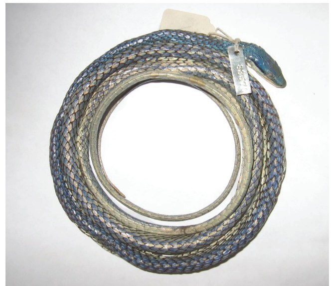
Figure 1. Paratype of Leptophis copei (USNM 83570). Note the two blue dorsolateral stripes separated from each other by a vertebral stripe along the entire length of the body.