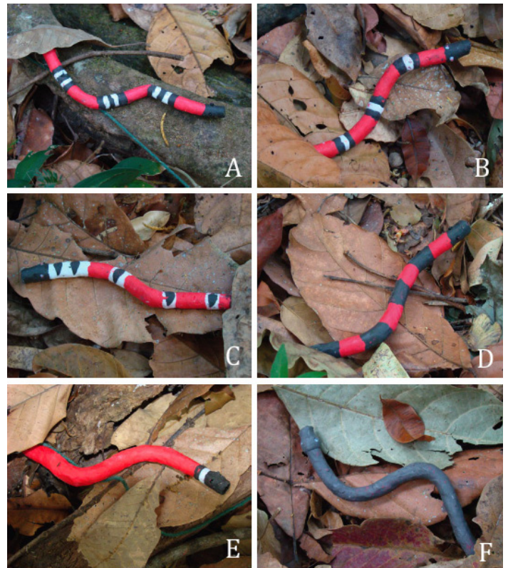
Figure 1. Clay model replicas of six snake patterns. The patterns are: A- TT (tricolor triad), B- TD (tricolor dyad), C- TSB (black diamond blotches (outlined in yellow) on red), D- BIR (red and black bicolor), E- UCD (unicolor in red with black nuchal collar), and F- CTR (uniformly gray control).

Snake replicas were made using pre-colored nontoxic plasticine (Acrilex) threaded onto a plastic tube and a wire to create an S-shape (following Brodie 1993). All snake models looked very similar to juvenile or adult snake species found in the CNPV. Replicas were 1.5 cm in diameter and 20 cm in length, and each replica had a “head” representing the anterior end of the snake, while the posterior end was anchored into the ground by wire. Six different color patterns were constructed following the classification proposed by Savage & Slowinski (1992): (A) TT (the model/perfect mimic, a tricolor triad characteristic of the venomous coral snake M. frontalis and mimics such as Simophis rhinostoma , O. trigeminus , and O. guibei ), (B) TD (tricolor dyad characteristic of E. aesculapii ), (C) TSB (black diamond blotches (outlined in yellow) on red, characteristic of the imperfect mimic O. rhombifer ), (D) BIR (red and black bicolor, characteristic of O. petola ), (E) UCD (unicolor in red with black nuchal collar characteristic of non- or mildly venomous rear-fanged colubrid snakes of the genera Apostolepis and Phalotris and juveniles of Clelia ) and (F) CTR (uniformly gray control, similar to non-venomous colubrid snakes of the genera Chironius and Erythrolamprus ) (Figure 1).