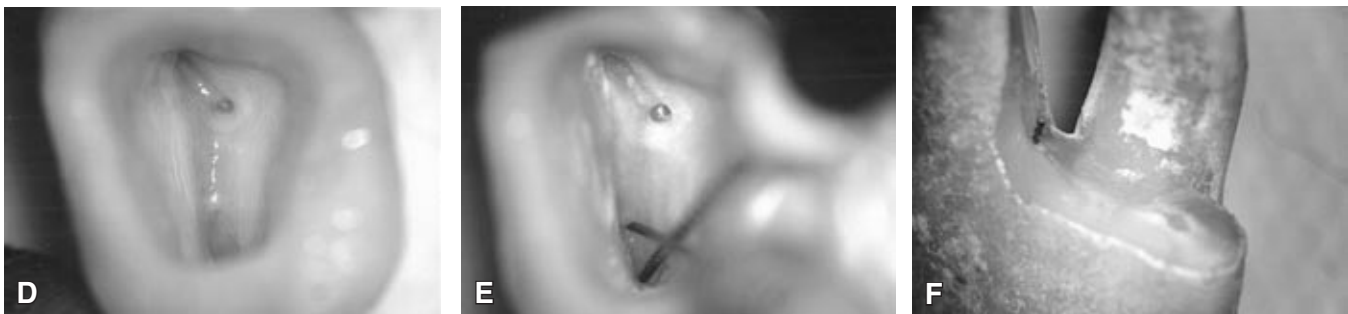
FIGURE 1D THROUGH F - Aspect of the final access cavity (D). Locating of a fourth canal in an unusual anatomical area, next to the palatal canal (E). Sectioned root showing the mesio Buccal and the mesio Lingual canals, which are distinct canals (F).

another group of studies demonstrated a reduced incidence of the ML canal, around 50% 5,6,9,10,16 . We believe that these different values can be accounted for by the different methodology adopted by those researches, especially regarding the difficulty in obtaining appropriate standardization of the variables of anatomical researches.