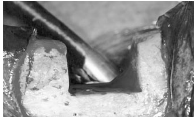
FIGURE 1 - Clinical appearance of the surgically created bone defect.

Oral prophylaxis was performed 2 weeks prior to tooth extraction and again 2 weeks prior to the creation of the bone defects. The animals received 1.5 ml/10 kg of acepromazine (Fortdodge, Campinas, SP, Brazil) followed by intravenous injection of 25% sodium thiopental solution (Cristália, Itapira, SP, Brazil) (0.5 ml/kg) and local administration of 2% xylocaine (Merrel Lepetit, Santo Amaro, SP, Brazil) (1:50,000 epinephrine) for all surgical procedures. At the beginning of the experiment, the first, second and third lower molars were removed unilaterally, creating an edentulous area in the posterior region of the lower jaw. After 3 months of healing, full-thickness midcrest incisions were utilized following which full thickness flaps were elevated buccally and lingually to expose the edentulous alveolar ridge. Osseous saddle-type defects measuring approximately 12 mm x 8 mm were prepared in the edentulous alveolar molar area of the mandible by removing the buccal and lingual plates and associated cancellous bone (Figure 1), utilizing surgical rotary and hand instruments under profuse saline irrigation. The exposed bone surfaces were planed to smooth the margins of the defect. An attempt was made to make the defects uniform; however, due to variations in the basal width of the ridge, exact standardization was not