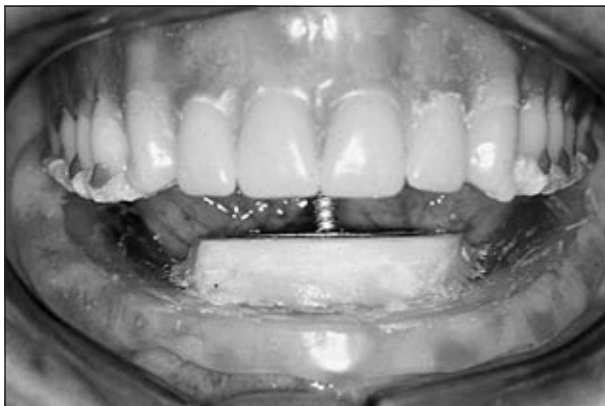
Figure 2 - Record plates repositioned in the mouth with free-way space suppression.

with small amounts of zinc oxide-eugenolate paste (Lysanda Produtos Odontológicos Ltda., São Paulo, SP, Brazil) to confirm the relation with greater precision. The facial arc was adjusted and the relation between teeth and wax rim were transferred to the articulator (Gnatus modelo 9600, Gnatus equipamentos Médico-Odontológicos Ltda., São Paulo, SP, Brazil) with the incisal guide pin graduated at "0". Separation of the superior and inferior baseplates from the metallic gimlet/platform set of the intra-oral record apparatus was performed using a carborundum disk, preserving the maxillomandibular relation. The gravitational center of the superior cast was determined and the intra-oral record plates were fixed with chemically-activated acrylic resin (Clássico Ind. e Com. Ltda., São Paulo, SP, Brazil) in the superior cast and in the baseplate of the inferior denture, respecting the following criteria: