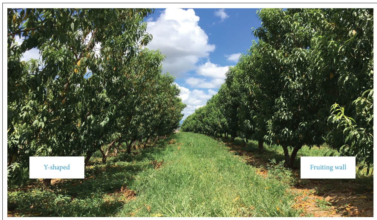
Figure 1. Comparison of training systems: Y-shaped and fruiting wall. Photograph of experimental area at the municipality of Jarinu, São Paulo state, Brazil.