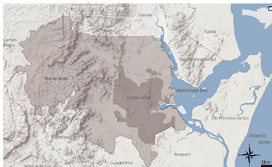
Figure 1. Location map of the municipality of Joinville, SC, Brazil.

This study was carried out in the city of Joinville, located in the northern coast of the state of Santa Catarina (26°18'14" S and 48°50'45" W), in the South of Brazil. It has a total extension of 1,124.10 km 2 , with 913.7 km 2 of a rural area and 210.4 km 2 of an urban area (15) , bordering the Serra do Mar and Babitonga Bay (Figure 1). The altitude ranges from zero to 1,325 meters and, according to the classification of Köppen and Geiger (19) , the regional climate is Cfa, described as humid to super humid, dependent on the Atlantic Polar mass (winter and autumn) and Atlantic Tropical mass (summer and spring) for the season and temperature changes. There is no dry season, and temperatures range from 31 °C (maximum means) in January to 13 °C (minimum means) in July, with mean annual relative air humidity of 76.04%.