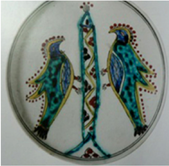
Figure 10: Pattern of tree in china plate made in Kütahya [7]. [Figura 10: Padrão de árvore em placa cerâmica produzida em Kütahya [7].]