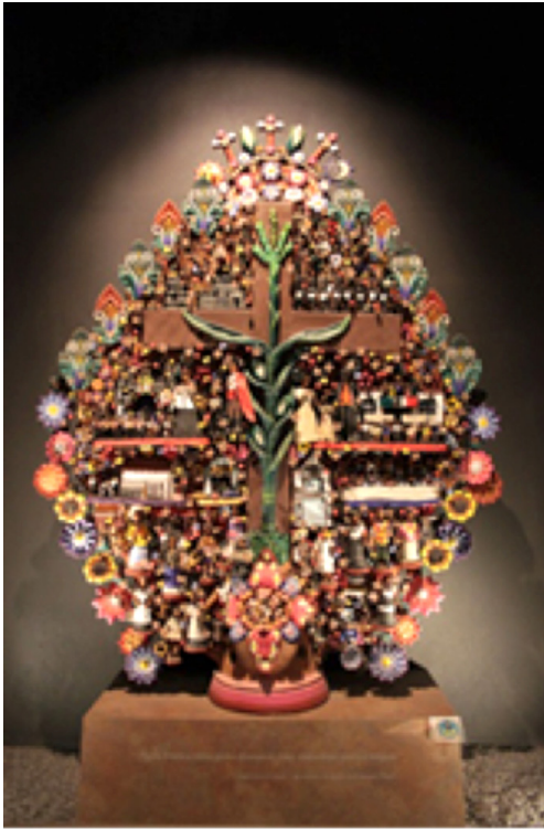
Figure 3: Tree of Life candelabrum with peacock; Mexican Museum of Anthropology. [Figura 3: Candelabro de Árvore da Vida com pavão; Museu Mexicano de Antropologia.]