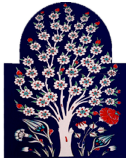
Figure 11: Turkish bath tile (80 cm x 100 cm), contemporary work in china production studio in Kütahya [10]. [Figura 11: Azulejo de banho turco (80 cm x 100 cm), trabalho contemporâneo em ateliê de produção de cerâmica em Kütahya [10].]