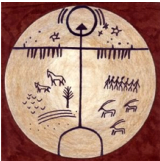
Figure 7: The tree of life on the figure of the shaman's drum [5]. [Figura 7: A árvore da vida na figura de tambor xamânico [5].]

The intended purposes and meaning of symbols and patterns differ from one culture, geography, and religious belief to the other. Tree of life plays a role to communicate in the Shaman culture, which is the origin of Turkish culture. Therefore, tree of life figure is often used in the places Shamanists live or on clothes they wear. According to some sources it is said that Shamanists believe that they were born from trees of life. The use of tree of life by Turkish tribes has continued after Shamanists. There are seven or nine branches or nicks as the symbol of the layers of the sky on the tree of life, which exists in the centre of the universe according to ancient Turkish religions. This figure is usually described as a beech tree, the branches or nicks are used to climb on the tree and to reach God (Fig. 7). The use of tree figure continued after the Turkish's acceptance of Islam. In the holy scripture of Islam, Koran, it is stated that the trees were created as the sign of divine grace and power; it is also drawn attention to the reality that a lot of living being cannot live without the trees (conveyed by [4]).