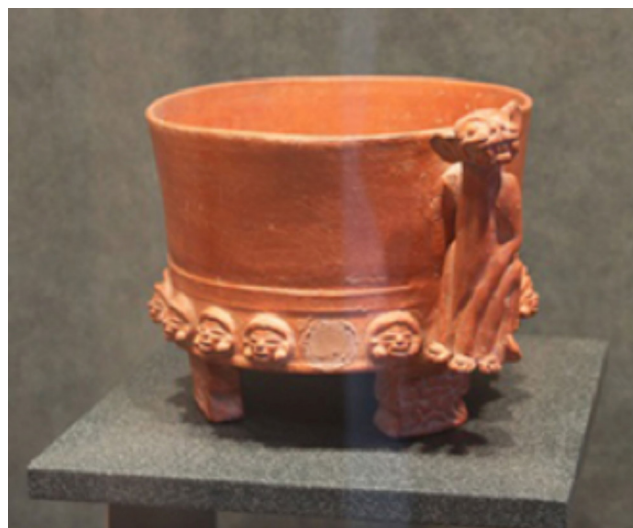
Figure 2: Maya ceramics, terra sigillata; Mexican Museum of Anthropology.

things at every moment. They are the richness of traditional hand crafts which shed light on today” [3]. Among the Mexican handcrafts which has a rich framework, pottery is one of the most popular and ancient field (Fig. 2). Mexican ceramics which is usually formed by using coil or moulding methods differs in the sense of form or ornaments according to the region they are produced. Metepec which is one of the most important centres of ceramics in Mexico continues to exist thanks to the originality of its ceramics.