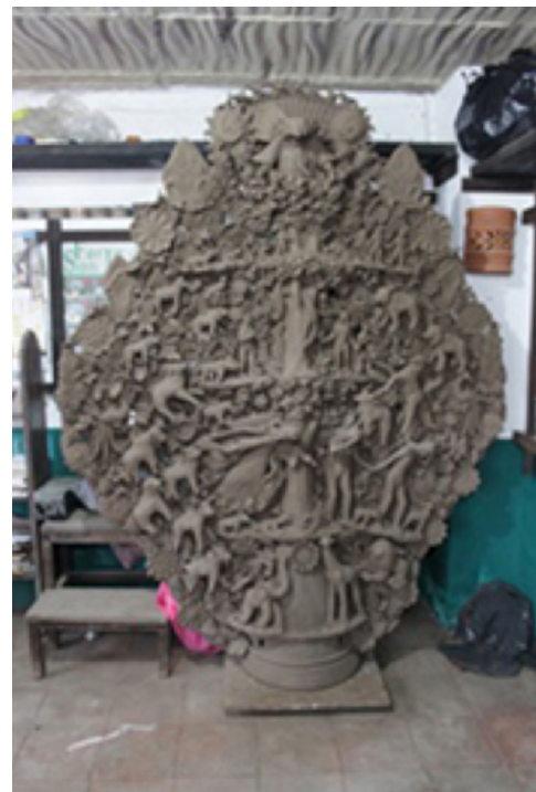
Figure 6: Noah's Ark themed Tree of Life. [Figura 6: Árvore da Vida com tema de Arca de Noé.]