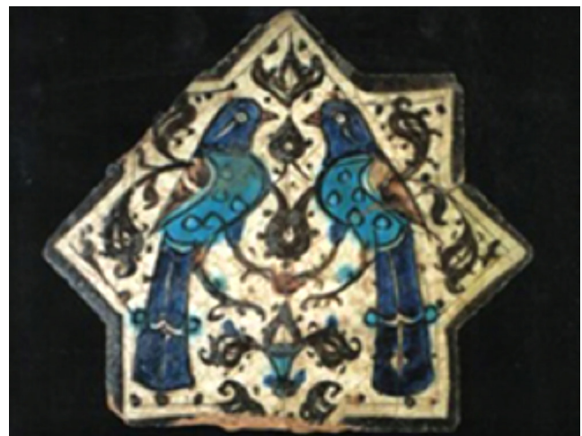
Figure 9: Example of china tile in Kubad Abad Palace [9]. [Figura 9: Exemplo de ladrilho cerâmico em Kubad Abad Palace [9].]

The tree of life pattern which was used in mosques, Moslem theological schools, palaces and handcrafts Seljuk and Ottoman arts has a rich and various expression. Like Oney [8] said, the figures of the tree of life like these in this rich expression of Anatolian Seljuk art can be categorized as: i) the tree of life represented on its own; ii) the tree of life surrounded by a pair of bird; iii) two headed eagle stood for a tree of life on an arabesque surface; iv) the tree of life represented as a whole and accompanied animals; v) symbolic explanation of the tree of life pattern (Figs. 9 to 11). When the pattern of the tree of life in Turkish art of ceramics is analysed, it is seen that it was used as an architectural element on china tiles in Seljuk art, as a decorative element on plates and functional three dimensional forms in Kutahya and Iznik chinas.