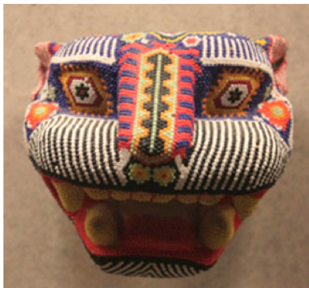
Figure 1: Example of Mexican handcrafts, bead braided Huichol; Mexican Museum of Anthropology.

[Figura 1: Exemplo de artesanato mexicano, cordão trançado Huichol; Museu Mexicano de Antropologia.]