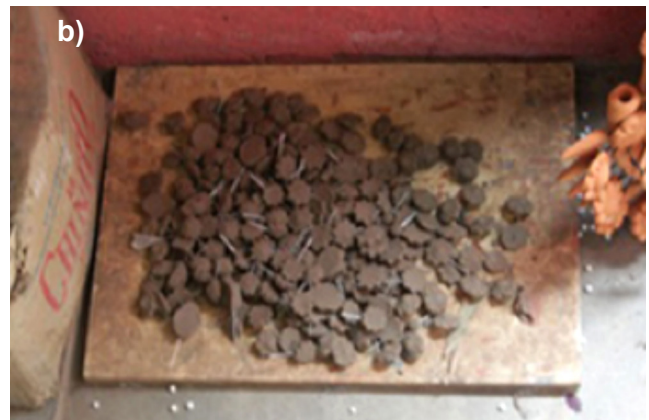
Figure 5: Flower figure (a) and details (b) for assembly on the tree of life. [Figura 5: Figura de flor (a) e detalhes (b) para montagem sobre a árvore da vida.]