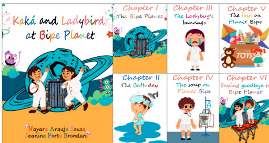
Figure 1 - A book cover and chapters. São Luís, MA, Brazil, 2023

The CS was built for this study. It presents the experiences and discoveries of two children hospitalized in the PICU and approaches the environment as an unknown planet full of care. The graphic material is double-sided and consists of 62 illustrated and colored pages. It has a simple and direct language. The content was created and organized using the free online graphic design tool Canva (Figure 1).