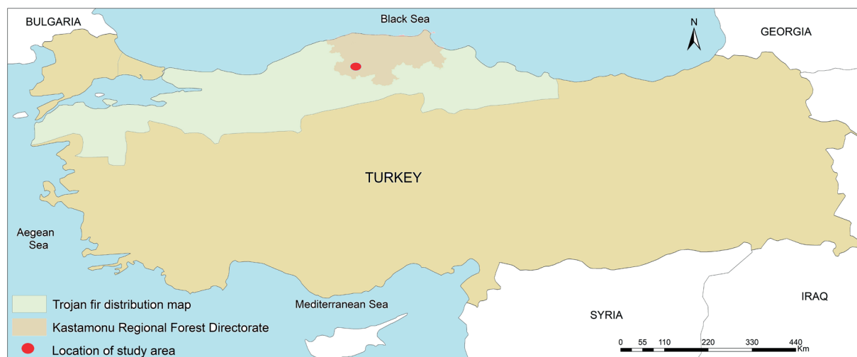
FIGURE I Natural disturbance range of Trojan fir, the boundary of Kastamonu Forest Directorate, and location of study area.

As mentioned above, BA was calculated for each 100-m 2 plots, while PAR T , LAI and HCB were measured above each seedling selected. There was a significant relationship between BA and PAR T ( p < 0.001 ), as well as between BA and LAI ( p < 0.001 ) (Figure 2). Increasing