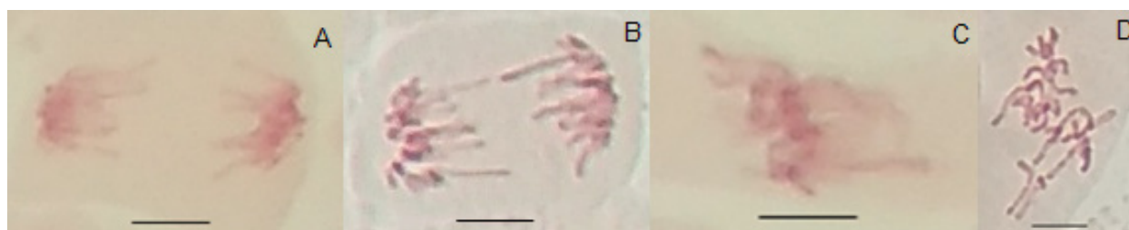
FIGURE 2 Characteristics evaluated in seeds and seedlings of D. nigra after different seed immersion times in NaOCl. **Significant at a 5% level of probability. Abbreviation: PMTE. Point of maximum technical efficiency.