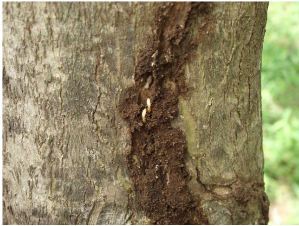
FIGURE 1 External gallery of C. testaceus (Linnaeus, 1758) termite in the stem of 4.2-year-old Tectona grandis clonal plantation.

Internal damages promoted by termites were characterized by galleries along the entire heartwood stem length and by some soil, carton material and termite feces inside the galleries (Figure 2).