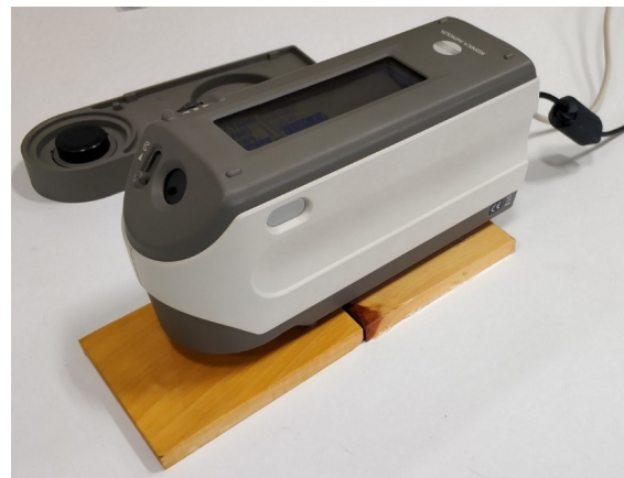
FIGURE 4 Colour Measurement Test Samples and Test Equipment.

a^* and b^* represented the chromaticity coordinates; +a^* for red (+60), -a^* for green (-60), +b^* for yellow (+60), and -b^* (-60) for blue L^* and represented the lightness in the range from black (0) to white (100), (Özkan, Temiz and Vurdu, 2017). For each test samples, four measurement points were marked. Specimens colour coordinates L^* , a^* , and b^* values were determined both before and after varnishing. These values were used to calculate the colour change value ( \Delta E^* ) among the varnished samples using two different varnishes according to the ASTM D-2244 (2015) standard. Colour measurement test equipment are shown in Figure 4.