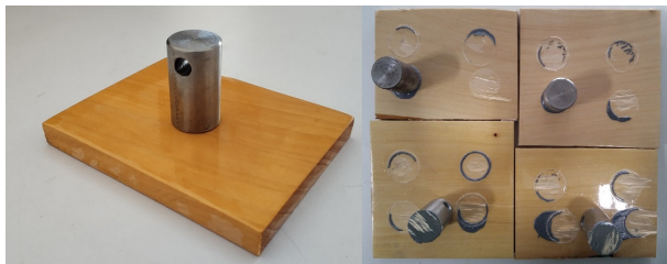
FIGURE 2 Varnish Adhesion Strength Test Samples and Test Cylinders.

Adhesion strength was calculated according to Equation 1 in MPa ( \text{MPa} = 1 \text{ N}\cdot\text{mm}^{-2} ), Where: X denotes the adhesion strength (MPa), F denotes the rupture force (N), d represents test cylinders with a diameter of 20 mm, and \pi denotes Number of Pi.