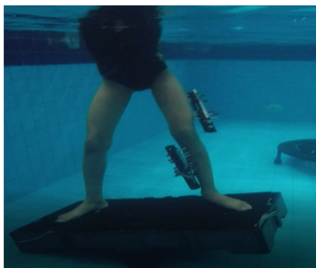
Fig. 2. Balance training and weight bearing using the physical properties of water.

Buoyance compensates for the EF weight, improves muscle activation, and allows weight bearing (Fig. 2) at the beginning of the limb lengthening and/or correction process even in case of weight-bearing restrictions on the ground. With water up to the nipple line, which equates to 35 % weight bearing, patients can use water buoyancy to protect their tissues against gravity, decrease compressive forces for ambulation, and improve cardiovascular conditioning. 2