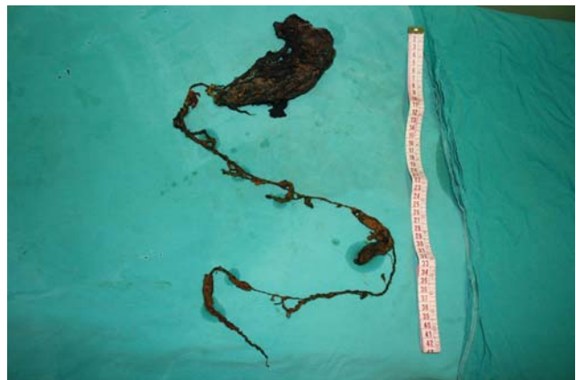
Figure 3 - 86 cm long cotton bezoar

and had a very bad odor. A jejunal catheter was placed for further feeding, and the gastrotomy was closed. A liver biopsy was performed before the closure of the abdomen. Pathological examination of the liver yielded focal steatohepatitis with minimal inflammation. The patient died on the 36 th postoperative day due to multiorgan failure after pulmonary sepsis.