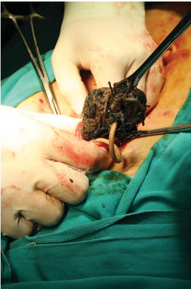
Figure 1 - Cotton bezoar with trapped feeding tube