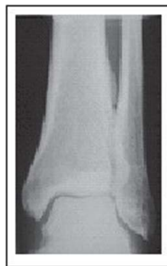
Figure 3 - Periostosis in left tibiae and fibulae, limited to the diaphysis with a monolayer configuration

The patient had been asymptomatic until 1 year previously, when oligoarthritis migratory manifestation commenced, without constitutional symptoms. No malignant manifestations, infectious diseases, hyperlipidemia, or medicine intake antecedence were found. Regarding connective tissue disease, radiography analysis of the extremi-