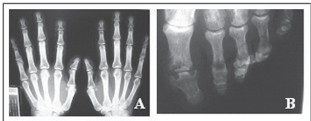
Figure 2 - Anteroposterior view of radiographs showing fingers and toes with mushrooming of the tufts (2A, 2B)

A nonsteroidal anti-inflammatory and an antimalaria drug (diphosphate chloroquine 250 mg/day) were introduced followed by methotrexate (10 mg/week), with efficient control of arthritic crises as well as ESR and CRP levels.