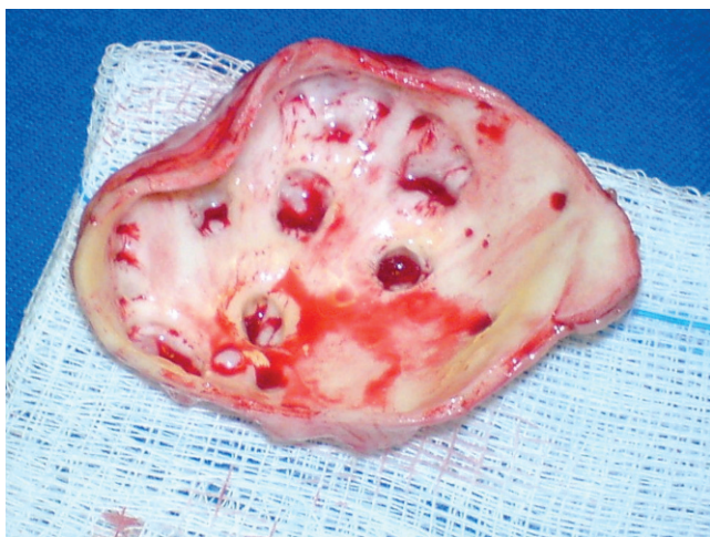
Figure 2 - Internal macroscopic aspect of the ascending aorta segment. Note the multiple focal cavities of different sizes corresponding to the external dilations.

The histopathological findings were ascending aorta with areas of intimal fibrosis with dystrophic calcification consistent with arteriosclerosis. Areas of medial cystic degeneration with saccular dilations were observed to be diffusely distributed; inflammation was absent (Figure 3-A,B,C). The