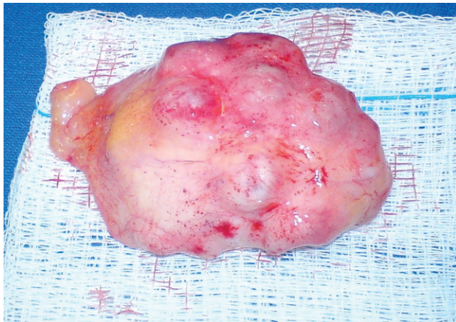
Figure 1 - External macroscopic aspect of the ascending aorta segment.

Antegrade cold blood cardioplegic solution was infused every twenty minutes. The three thickened aortic leaflets, as well as the anterolateral convexity and anteromedial concavity of the aorta were excised, leaving the posterior one third, macroscopically normal, to serve as support tissue to the vascular prosthesis that would be placed. Samples were submitted for histological study, and the procedure was completed. The prosthesis implanted was a mechanical no. 21; a Dacron tube prosthesis (no. 24) was positioned in replacement of the ascending aorta above the coronary ostia. De-airing was performed through a catheter placed in the tube; the aortic cross-clamp was removed. As the heartbeats became effective, the cardiopulmonary bypass was ended, and the surgery was finalized as usual. The patient was sent to the intensive care unit, where he remained for one day. He was then discharged by the tenth day in good health. He recovered and has lived until the present moment without complications.