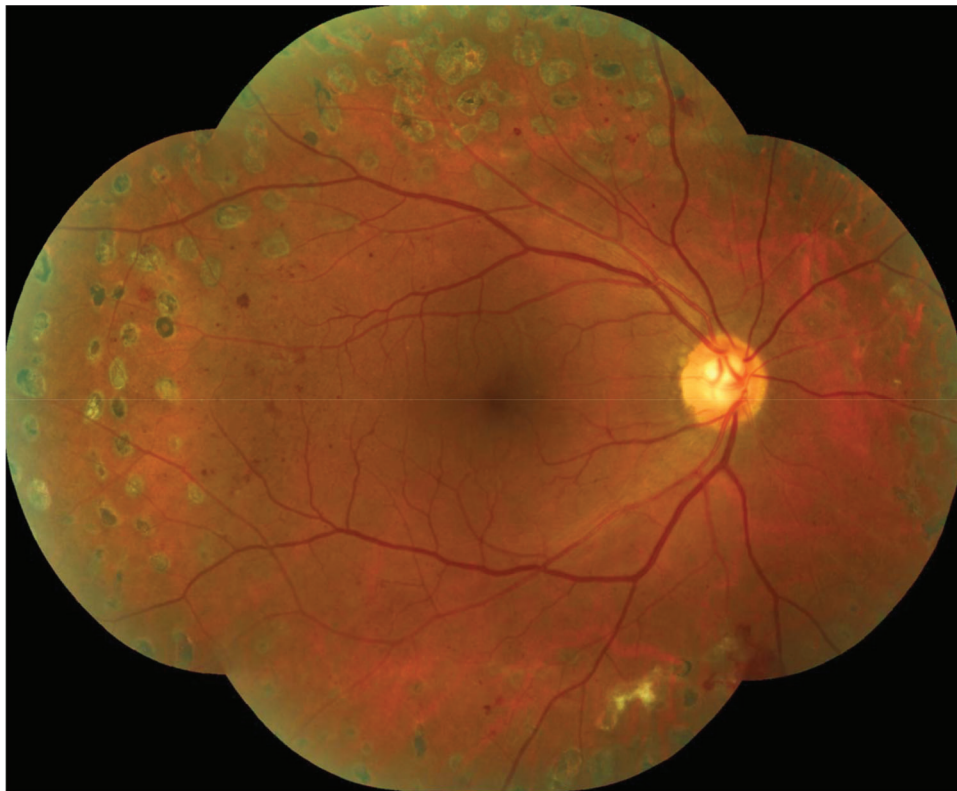
Figure 3 - Retinography (montage) of the posterior pole and mid periphery exemplifying the pattern of laser photocoagulation performed in the study.

applied in the study and the distance between the laser burns and the optic disc margins.