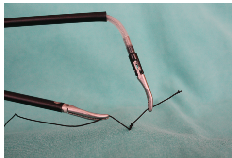
Figure 3 - The reef knot is converted into a slip knot by applying distracting forces on the suture material at the two opposite points.