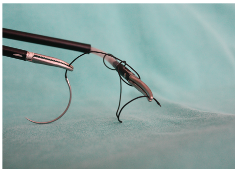
Figure 2 - The suture is grasped with the Reticulator instrument at a point that is a few centimeters distal to the exit of the suture from the tissue.

using routine instruments, thus providing cost-effectiveness, feasibility, and minimal instrument transfer. Moreover, with this technique, the instruments are pulled away from the tissue during knotting, so it is safer than the conventional approach. It reduces the possibility of inadvertently catching the organs in the suture.