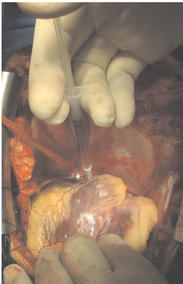
Figure 1 - Intramyocardial injection of autologous bone marrow cells during CABG in non-bypassable areas of ischemic, viable myocardium.