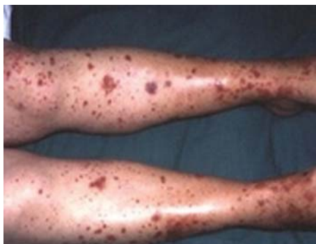
Figure 2 - Palpable purpuric lesions on the lower limbs

The patient presented a favorable clinical response as well as an improvement in the laboratory parameters with