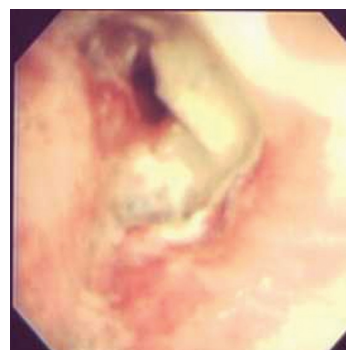
Figure 1 - Endoscopic image of necrosis in the bronchial anastomosis

days, and the total length-of-stay was 28 days. Initial immunosuppressive therapy included tacrolimus, prednisone and azathioprine, substituted 14 days later with mycophenolate mofetil, due to leukopenia. Prophylaxis against Cytomegalovirus and P. carinii was provided by treatment with ganciclovir and co-trimoxazole. The patient developed significant inflammatory infiltration in the left lung on the 14 th postoperative day. Transbronchial biopsy showed minimal rejection (grade A1) of the transplanted lung, and the patient was treated with methylprednisolone resulting in total recovery. A bronchoscopic evaluation also showed partial necrosis at the anastomotic site, but no signs of dehiscence (Figure 1).