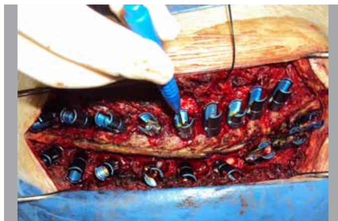
Figure 1. Electromyography stimulated through the electrode positioned directly in the screw implanted in the pedicles.

The study included 16 patients: 12 female (75%) and four male (25%), with ages ranging from 11 to 26 years (average of 16.6 years). In all, 281 pedicles were instrumented (average of 17.5 per patient) with a minimum of 12 and a maximum of 26. The minimum follow-up