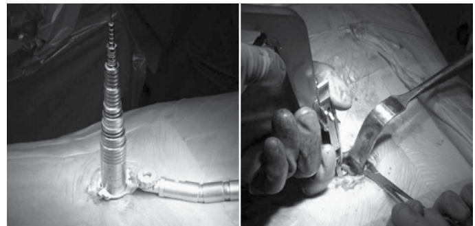
Figure 2. Tubular approach of the lumbar spine (Medtronic©) for decompression and DIAM application.