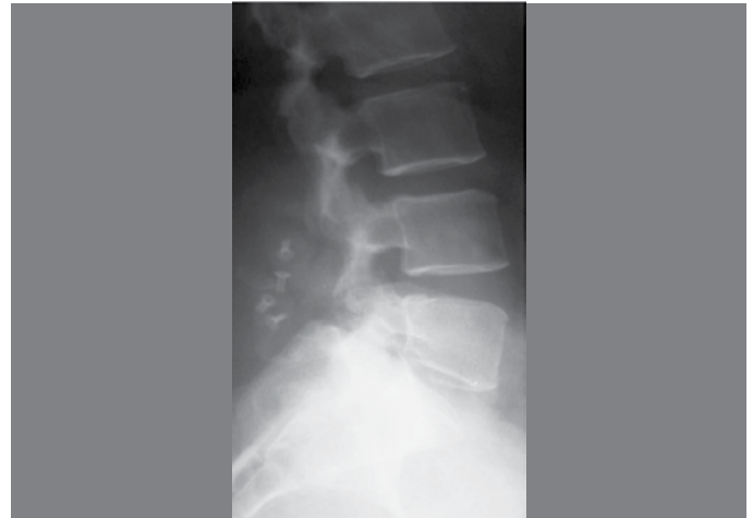
Figure 1. Lateral X-ray of the lumbar spine revealing dual system DIAM (L4-L5-S1).

In patients with degenerative lumbar pathology, general health was measured in terms of quality of life, using an official form in Portuguese, with its evaluation algorithm provided by Euroquol group 1990 (EQ-5D), and towards this end the study