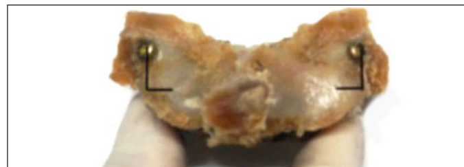
Figure 1. The distance of the entry point at C7 pedicle screws from the midpoint (MP) of the lateral mass of the specimen 5 of the C7.

An adequate entry point was found in 12 of the 18 pedicles (66.6% accuracy, Figure 3). The authors found great variability in terms of the point of entry of the pedicle in the C7 lateral mass in relation to its center point, with values ranging from 2mm to 5mm laterally (mean of 3.3 for both sides - standard deviation 2.7 right and 2.0 left) and 3mm to 10mm superior to it (mean 5.8 ± 6.9 right and mean 5.6 ± 6.1 left). (Table 1) The angulation in the coronal plane was correct in 13 pedicles (72.2%, figure 3), where the screws were parallel to the pedicles, despite some of them having breached any of the walls. The pedicle angle values in the coronal plane were also highly variable, ranging from 38 to 62 degrees (m 49.67°-sd 6.64° on the right side and m 47.89°-sd 6.35° on the left side), but manual palpation of the trajectory probably compensated for this variation. (Table 2) In the sagittal plane angulation, 2 screws were misplaced cranially, touching the C6-C7 disc. The transversal diameter of the C7 pedicles ranged from 4 to 7mm (m 5.83-sd 2.83mm in the right pedicle and m 5.92-sd 2.96mm in the left pedicle). (Table 3)