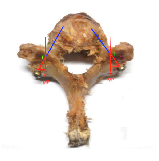
Figure 3. The midpoint (MP) of the articular mass is the projection of a triangle (T) that points to the base of the pedicle.