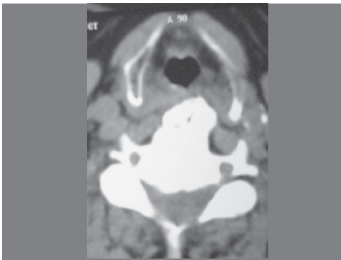
Figure 2. CT scan showing the osteophyte and the visceral compression.