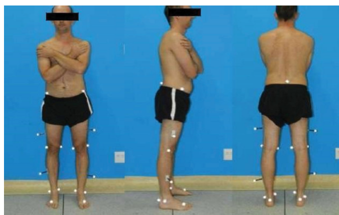
Figure 1. Tracker location.

The data collected from the 9 individuals included in the study is summarized in Table 1. Most of the individuals were male (88%) with average values for height of 1.66 meters, age of 58.67 years, BMI of 27.39, and weight of 76.33 kilograms.