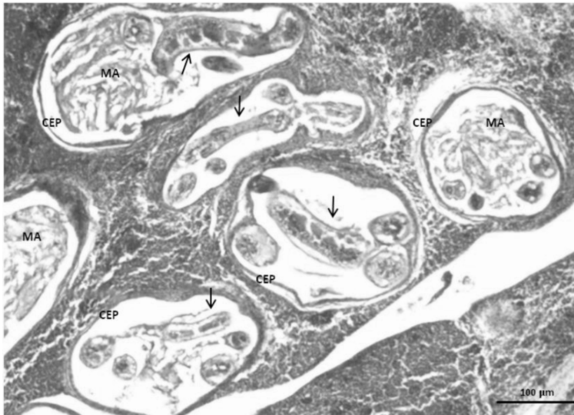
Figure 1 - Liver of Gymnotus spp. with capsule that involves the parasite (CEP), amorphous material (MA), encapsulated nematodes (arrows), 400X. HE.

and reacting immunologically to the parasite presence and or the presence of other stress agents.