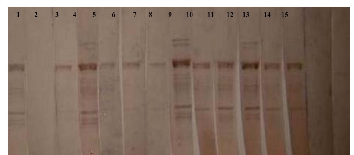
Figure 2 - Western blots using rSeM as antigen. 1: positive control (anti-6×His alkaline phosphatase conjugated MAb); 2: negative control; 3: strain 2; 4: strain 6; 5: strain 25*; 6: strain 30*; 7: strain 31; 8: strain 26*; 9: strain 8*; 10: strain 35; 11: strain 14; 12: strain 29; 13: Vaccine A; 15: Vaccine B. (*, atypical strains).