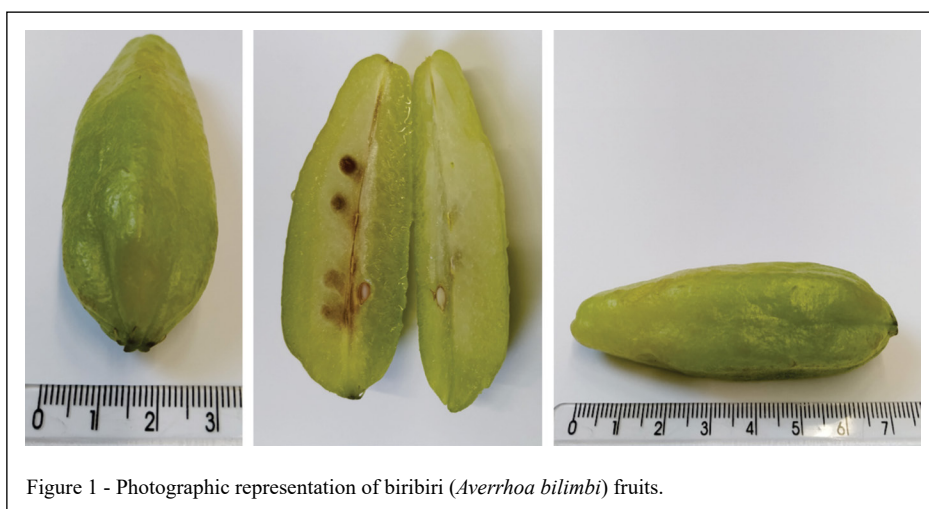
Figure 1 - Photographic representation of biribiri ( Averrhoa bilimbi ) fruits.

Biribiri pulp showed low soluble solids and pH, and high titratable acidity (Table 1). The pH of the pulp was lower than that of fruits recognized as acidic by the population, such as lemon, acerola,