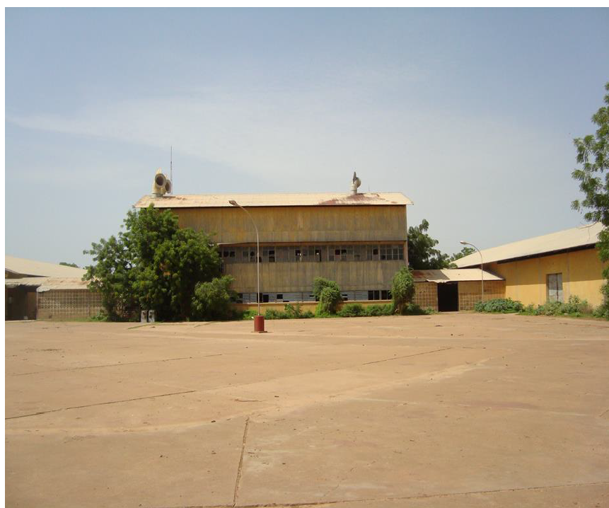
Figure 2 - The ruins of Dogofiri's rice mill.

aimed greater liberalization of the economy and a transfer of responsibility from the State to private actors. It is within this mission that ON is responsible for the recovery of water fees. Water fees are highly dispersed relative to the mean (Mean: 2.7545; Std. dev: 1.64337; Table 1 ). The payment of the water fee is relative to the number of hectares the farmer owns. water fees coefficient (1.09) is positive and significant, indicating its positive influence on income. A 1% increase in water fees increases income by 1.09% (Table 2). The increase in water fees would mean improving the quality of water management for high productivity. Before, water charges were a fixed levy of 400 kg of paddy per hectare. Currently, water fees are set at 56,950 CFA. This is still high for farmers living in precarious conditions. The rule in force is that any tenant who wouldn't pay the full fees for the use of water; calculated on the basis of the water requirements for rice per hectare allocated; would lose access to the entire area (SOUMANO & TRAORE, 2017). Farmers often prefer to pay for consumer goods such as two-wheeled gear and waste of their