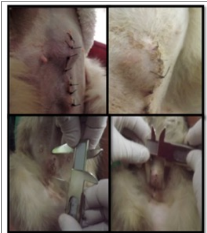
Figure 2 - Illustration scheme showing the increase in volume at the omental graft implantation site and measurements of the length and width of this increase in volume under the experimentally induced wound located in the ventral abdomen of the cat with the aid of a pachymeter.

carried out by BALTZER et al. (2015), free omentum was implanted on bone fractures surrounded by muscular tissue which is richer in vascularization than the subcutaneous tissue which is the site of implantation in the present study. Therefore, we may infer that the inflammation processes and repair have occurred more slowly.