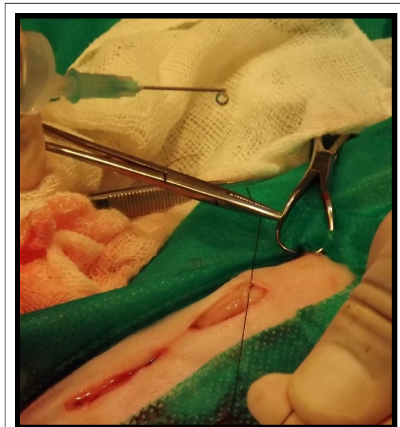
Figure 1 - Surgical field demonstrating the location of the median longitudinal celiotomy in the feline abdomen for elective OSH. It is possible to notice the location of omental graft fixation in the experimental wound made 1 cm above the incision for OSH. One of the fixation suture at the vertex of the free omentum graft without vascular anastomosis is noted.

The omental fragment maintained in sterile lactated Ringer's solution was then manipulated into a metal vat, and a portion of the omentum measuring approximately 2.0cm x 1.0cm was surgically removed. This tissue fragment was fixed to the muscular fascia with single stitches using 3-0 polyamide suture at each vertex of the experimental surgical wound on animals of the TG (Figure 1). Separate single points were used for skin raffia with 3 sutures made in