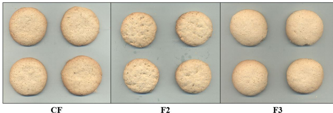
Figure 2. Control formulation (CF) and cookies with 50% of sugar reduction (F2) and 50% of fat reduction (F3).

a Results expressed as means ± standard deviation. Means followed by different letters in the same column differ significantly (p<0.05) by Scott-Knott test. b Control Formulation (CF), cookies with 50% of sugar reduction (F2) and 50% of fat reduction (F3). c Calculated by difference [100 - (moisture + lipid + protein + ash + total fiber)].