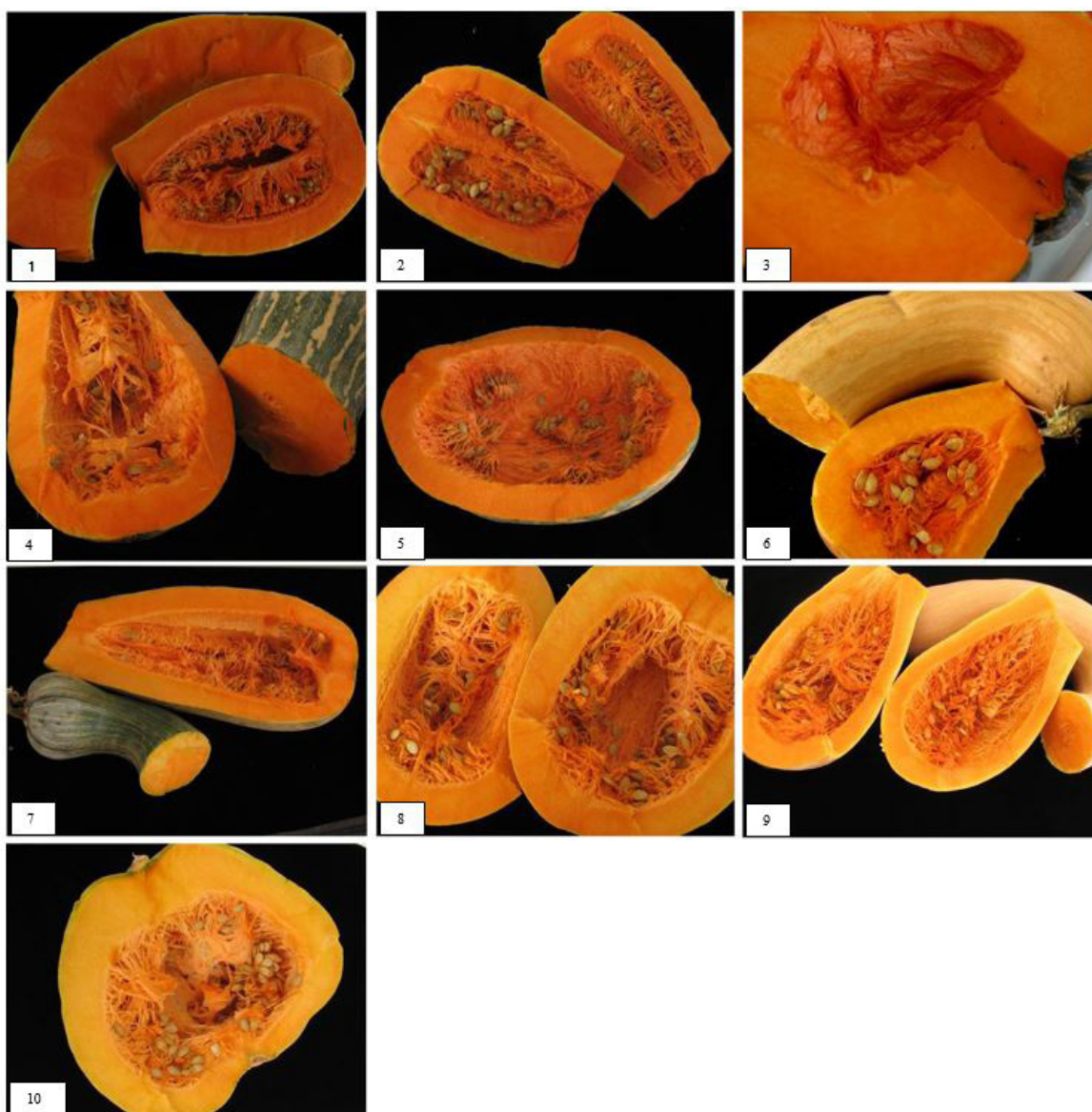
Figure 2. Pulp of the mature fruits of Cucurbita moschata accessions evaluated for bioactive compounds and minerals. (1) C52; (2) C267; (3) C389; (4) C93; (5) C81; (6) C99; (7) C423; (8) C136; (9) C116; (10) C218.

Means followed by the same letter in each column do not differ significantly by Tukey test at 5% of probability; calcium (Ca) expressed in g/kg of dry weight; magnesium (Mg) expressed in g/kg of dry weight; potassium (K) expressed in mg/kg of dry weight; copper (Cu) in mg/kg of dry weight; iron (Fe) expressed in mg/kg of dry weight; manganese (Mn) in mg/kg of dry weight; zinc (Zn) in mg/kg of dry weight.