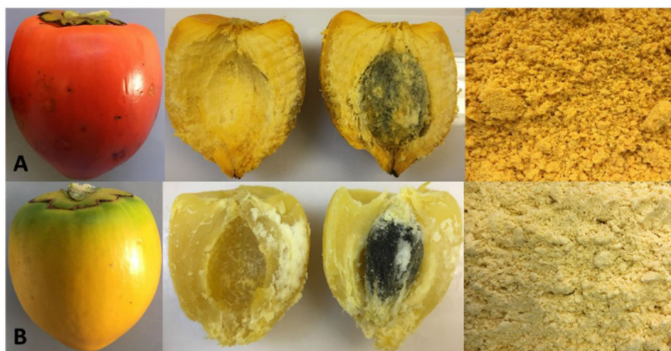
Figure 1. Peach palm fruits of the orange (A) and yellow (B) coloured peel varieties followed by the cooked fruits and the ground freeze-dried pulps.

The access to the selected fruits was registered in the Brazilian National System for the Management of Genetic Heritage and Associated Traditional Knowledge (SisGen, ACC7773). The peach palm fruits were sanitized by immersion in a sodium hypochlorite solution (100 µg/mL) for 10 min before cooking