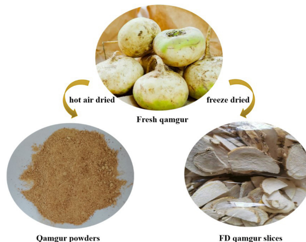
Figure 1. The picture of fresh qamgur, qamgur powders and FD qamgur slices.

The partial physiochemical properties of qamgur are shown in Table 1. Moisture content (Table 1) measurement is an important analysis performed on food product. Moisture plays a role in food quality, preservation and resistance to deterioration (Nielsen, 2009). Moisture content of fresh qamgur (82.8 g/100 g) was apparently higher than qamgur powders and FD qamgur slices (11.6 and 9.7 g/100 g). However, due to