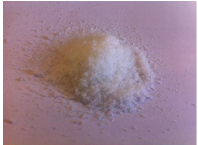
Figure 2. Powders obtained by VSD.

The samples produced by different drying devices differ significantly from each other relative to the mean diameter. When compared, the particles had very varying diameters, so that the VSD resulted in considerably larger particles with a mean diameter greater 555 \mu\text{m} while those obtained in spray dryer showed a mean diameter below 24 \mu\text{m} . The mean particle diameter was expressed as D [4,3] (De Brouckere mean diameter), which indicates the central point around which the volume of