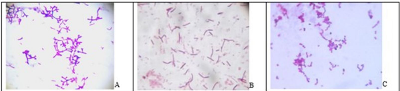
Figure 2. Gram stain, x1000, immersion, cedar oil: (A)-(B) longum strain B-5-M; (B) L. acidophilus strain L1-M; (C) Str. thermophilus strain SV-M.

Thirst of all, we had provided a microscopic analyze of the starter cultures to proof there purellity and microbiological safety for the food-products preparation. Microscopy of the starter culture samples showed there fully responds to the requirements of the relevant instructions for the preparation and use of starter cultures. The microscopy results declare pure microbial cultures in the tested samples (Figure 2).