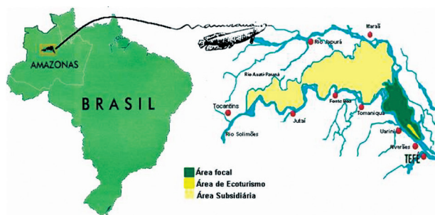
Figure 1. Mamirauá area.

Environmental setting and subjects. The Mamirauá and Amanã Sustainable Development Reserves (MSDR and ASDR, respectively) are located about 600 km West of Manaus (Amazonas) in the Brazilian Amazonian region (Figures 1 and 2). The reserves are contiguous conservation units designed to integrate the preservation of habitats with sustainable development of local resident communities. These areas are seasonally flooded, with water levels rising 10 to 12 meters above normal in the rainy season. The population lives in small communities along the riverbanks, each comprising 13 domestic households on average, which are typically linked by kinship ties that characterize the communities as nuclei of small groups of related individuals. The houses are timber-built and raised off the ground to protect them from high water levels. It is essentially a subsistence-based economy, with very low incomes (annual family income of about US$900). Activities are divided among fishing, growing manioc for flour and in some communities, hunting; which is practiced throughout the lifetimes of most subjects. Only among the elderly do physical activities decrease. Women tend to work making flour, housekeeping and taking care of children.