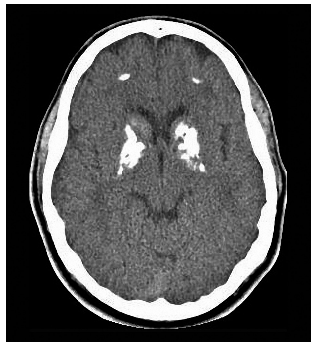
Figure 3. 23 year-old subject with massive brain calcinosis, but only with mild symptoms, suggesting a high level of resilience for brain calcinosis.

We also identified unusual images from subjects with massive brain calcinosis, yet only mild symptoms, suggesting a high level of resilience against brain calcinosis (Figure 3).