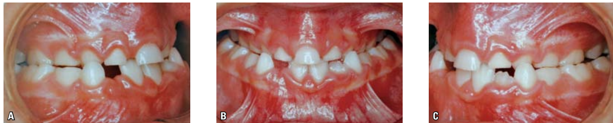
FIGURE 1 - A) Right lateral view of the clinical status at diagnosis. B) Initial clinical aspect of the case, with the presence of a solitary maxillary central incisor. C) Left lateral view of the clinical status at diagnosis.

Regarding the presence of systemic changes,