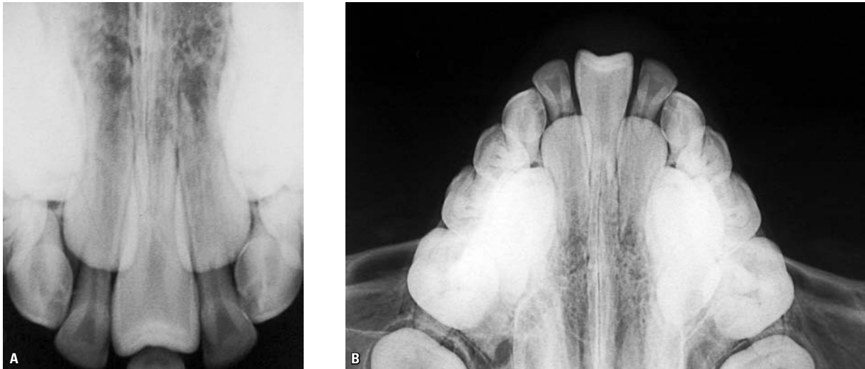
FIGURE 3 - A) Periapical radiograph, which confirms the presence of a solitary maxillary central incisor. B) Occlusal radiograph, confirming the presence of a solitary maxillary central incisor.

the patient's parent reported no involvement. This evaluation is important, since SMMCI may be associated with other developmental problems such as congenital nasal abnormalities, 1,4,11,15,16,17 growth deficiencies, 8,22 holoprosencephaly, 6,28 format changes and craniofacial morphology, 25 congenital heart disease, 8,10 among other local and systemic changes. However, there are studies that found no relationship between SMMCI and systemic changes. 5,27